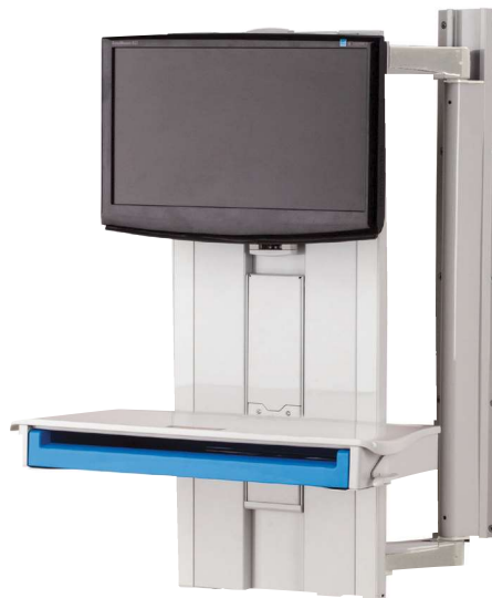
Premium Tandem Arm

Optional Access Pack organizes essential supplies for medication administration including medication cups, medical tape and alcohol wipes