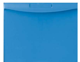
Pharmacy Robot Envelope Drawer