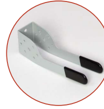
Forked Scanner Holder