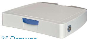
3" Drawer Electronic lock or non-locking

Flexibility to configure workstation with storage drawers in 3" or 6" depths