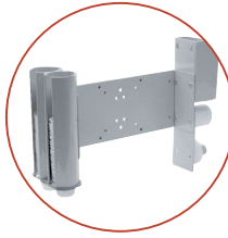
Access Pack for med cups, tape and alcohol wipes and/or scanner holder