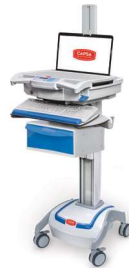
M38e Laptop Model