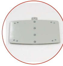
Infection Control Wipes Bracket