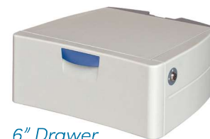
6" Drawer Electronic lock