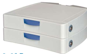
2-3" Drawers Electronic lock or non-locking