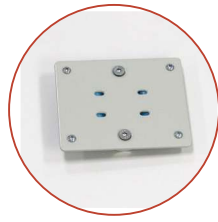
Infection Control Wipes Bracket