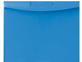
Pharmacy Robot Envelope Drawer