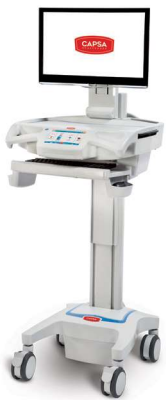
Carelink Document Model