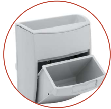
Locking Side Bin with removable bin