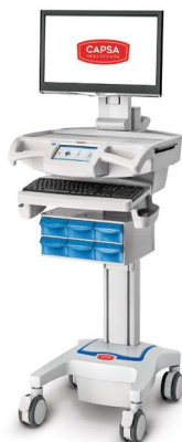
Carelink XP Model