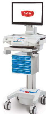
Carelink RX Model