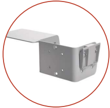
Barcode Scanner Shelf