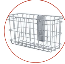
Wire Basket (standard or extra large)