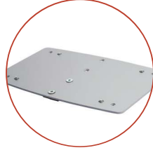
Mounting Plate for Sharps Bracket and Accessory Bins